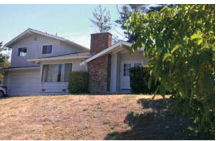
An unusually quiet exterior of the home on Wandel Drive